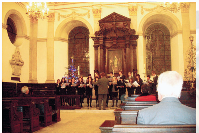
The Sennocke consort at St Lawrence Jewry.