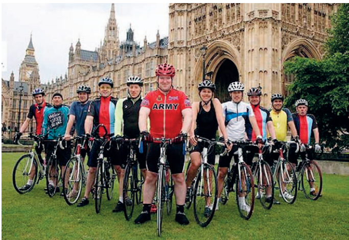
The team of 10 men and one girl before the drive North.

With a different team and with different rules perhaps, one day our lads will be able to call themselves "End to Enders".