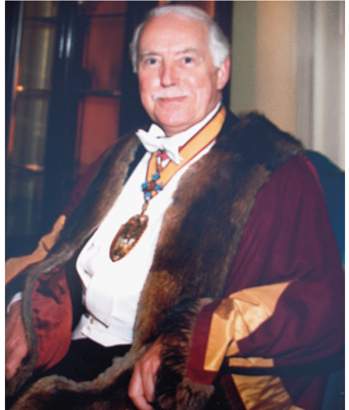
George who died aged 90 on 20th October.