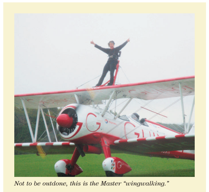
Not to be outdone, this is the Master "wingwalking."

The visit ended with a celebration lunch at the Michelin starred Royal Oak near Bray.